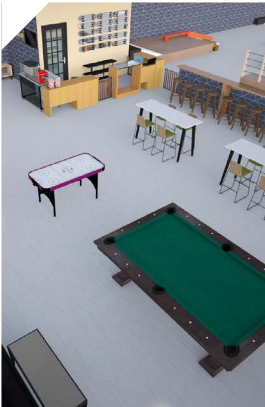
Mock up of the indoor and youth centre