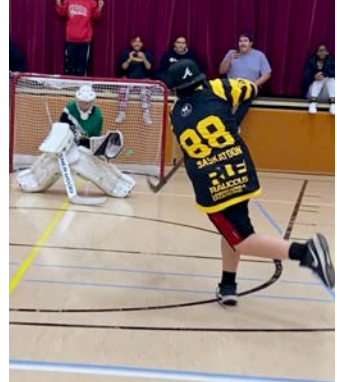
Some events on a typical Wednesday

Lately I've gotten the chance to hang out at the local Christian school here in Saskatoon. Every Thursday at lunch I hang out with the grade 7-8 boys where we play a few games then chat about life. So far it's just been building trust and getting to know each other, but we've had quite a bit of fun and I'm curious to see where it goes from there!