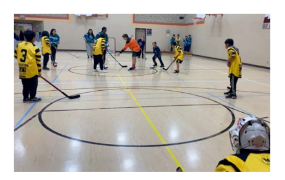
A couple opening draws from this year's action!

We want our kids to know we love them. We want to build them up and help them succeed. Hopefully we can help them avoid some of these problems, or at least encourage them when they fail. Life is hard. Hopefully we can make that difficulty just a little easier or at least less scary.